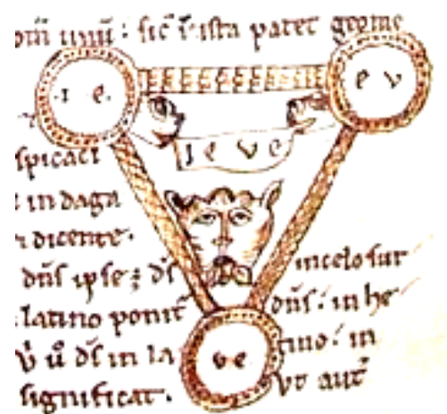
Figure 1. Petrus Alphonsi's Glyph of the Trinity